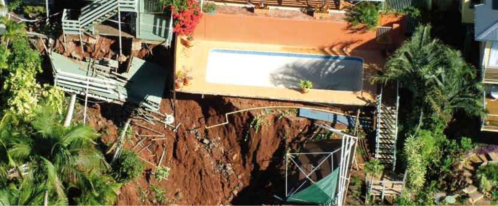
Homes perched precariously after a major landslide on Currumbin Hill, southeast Queensland, July 2005 Photo courtesy: Emergency Management Queensland.

inventories, aerial photographs, remote-sensing data and terrestrial photography.