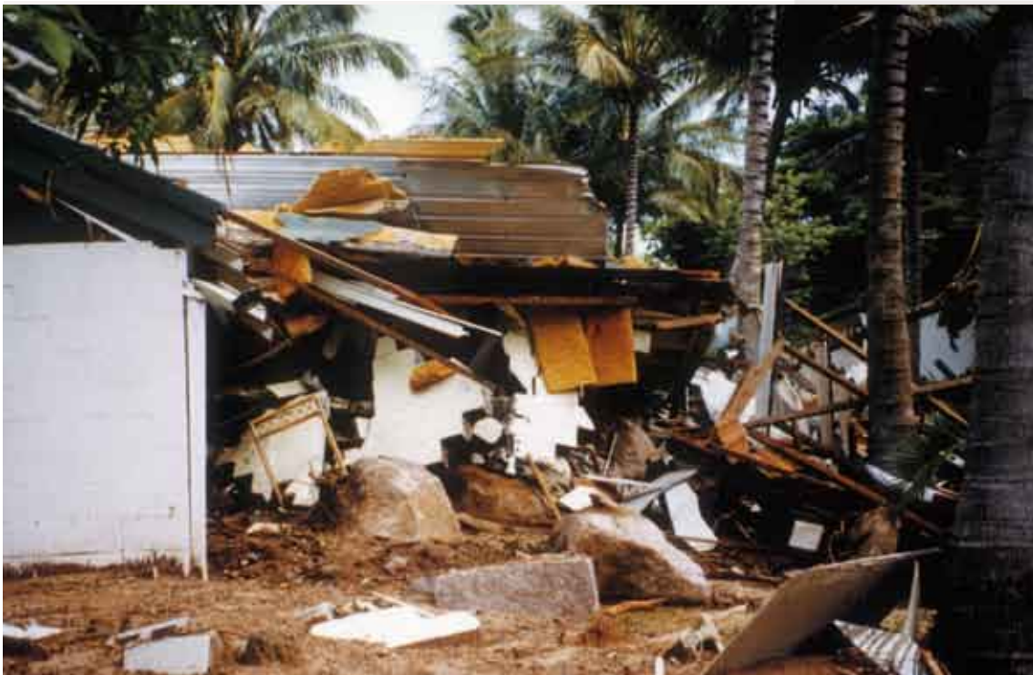
The aftermath of a debris flow damaging a resort on Magnetic Island, January 1998

This includes better understanding the relationships between fossil landslides and the climate at the time of failure. This would allow a picture of prehistoric landslides and their causes to be developed, analogous to the process of identifying and dating fault scarps formed during