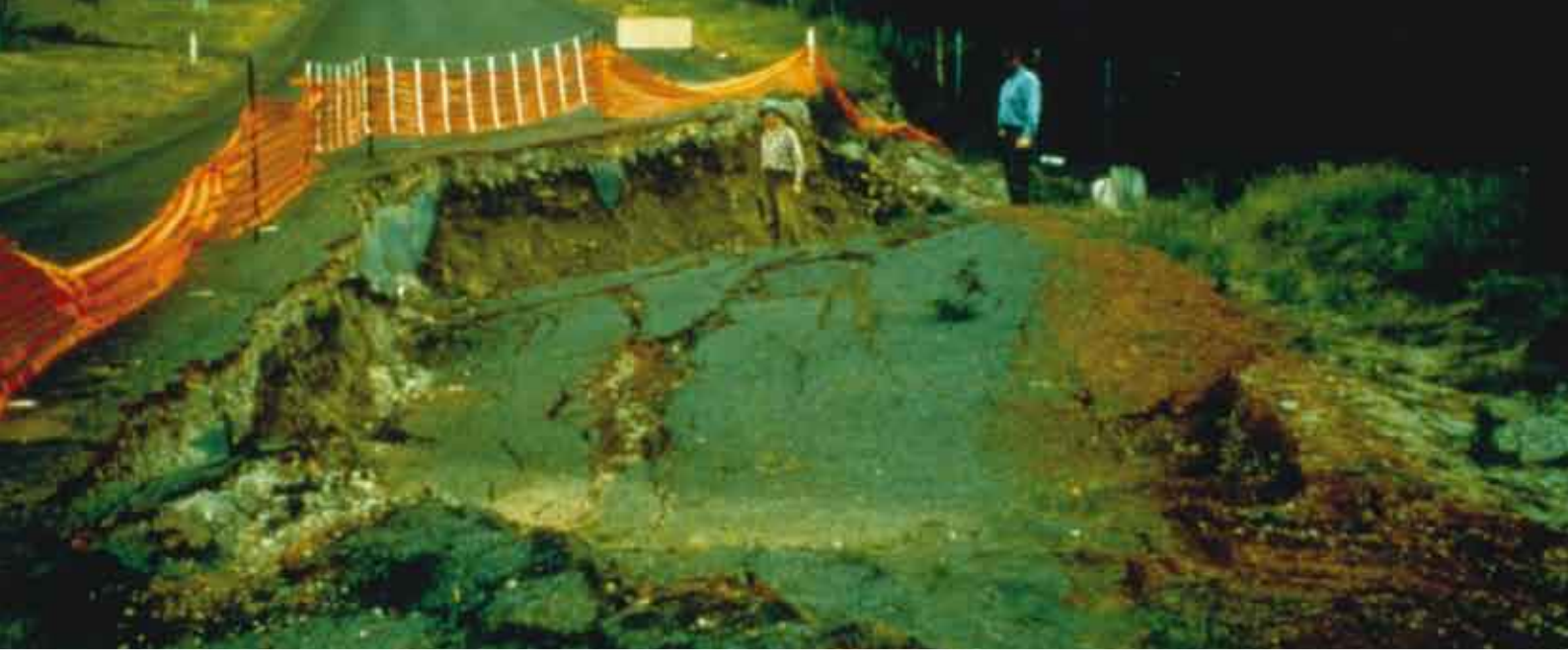
Damage to a road caused by a slow moving landslide at Pleasant Hills, northwest of Launceston, Tasmania

and displacement. Not only is stress detrimental from the psychological and social point of view, it also can have detrimental physical effects that may even lead to fatalities.