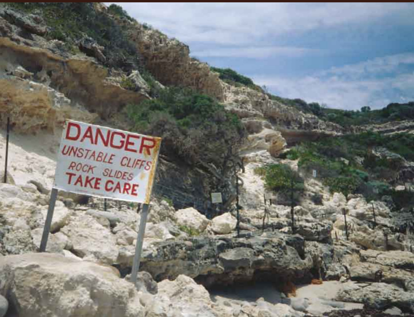
Site adjacent to a fatal limestone sea-cliff collapse at Cowaramup Bay, near Gracetown, southwest Western Australia, September 1996