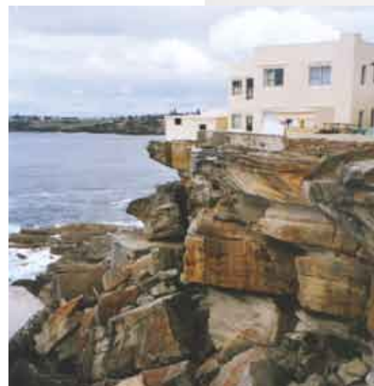
Residential development along a 22 metre high coastal cliff-top subject to ongoing erosion at North Bondi, New South Wales Photo courtesy: Greg Kotze/captured in 2005.

The management of landslide risk is important for all levels of government, non-government agencies and groups and the community. However, local governments have a major statutory responsibility for managing landslide risk and private industry plays a fundamental role in this process. Skills shortages and resource limitations are primary constraints in furthering landslide research.