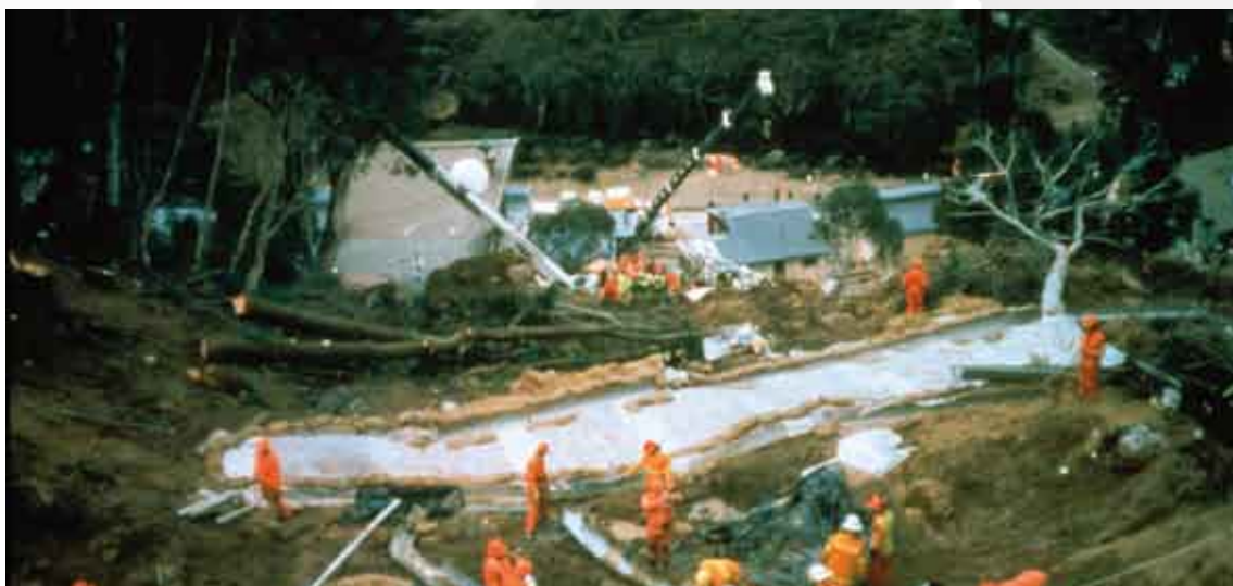
View from the headscarp of a fatal landslide at Thredbo, New South Wales, July 1997

The historic information on landslide events is fundamental, as it provides an insight into the frequency of the phenomena, the types of landslides involved, the volumes of materials involved, and the damage caused (van Westen and others 2005). The data should span as lengthy a time as possible and include landslide