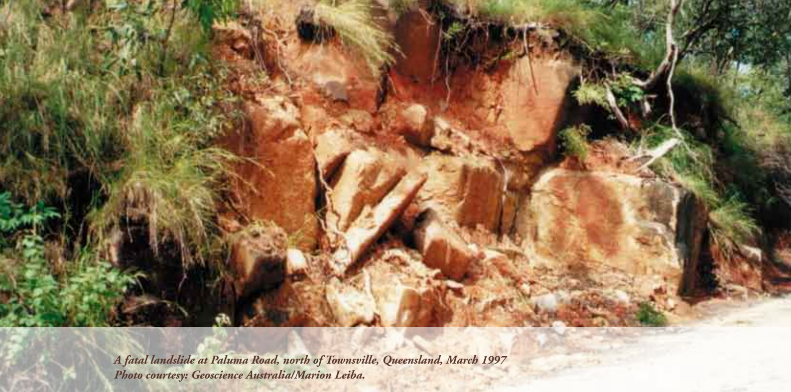
A fatal landslide at Paluma Road, north of Townsville, Queensland, March 1997

which provide best practice guidance, and some also offer professional training. For example, the Australian Building Codes Board identified that construction in areas prone to potential landslide hazard was an issue that requires consistent uniform guidance across the nation, and published a non-mandatory guideline (ABCB 2006) to provide advice on this matter.