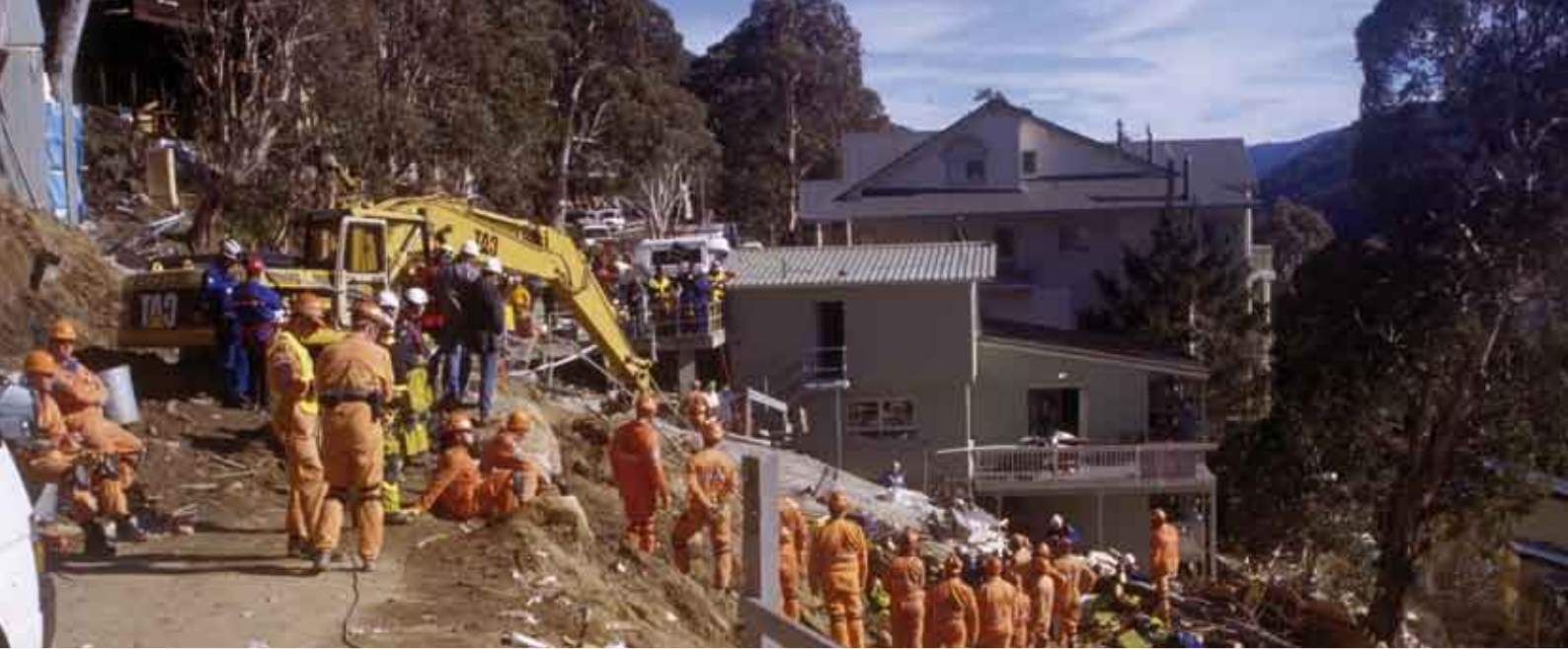
State Emergency Service volunteers involved in rescue efforts at a fatal landslide at Thredbo, New South Wales, July 1997

large prehistoric earthquakes. This is important, as decadal cycles influence the activity of deep-seated failures and raise issues with likelihood prediction.