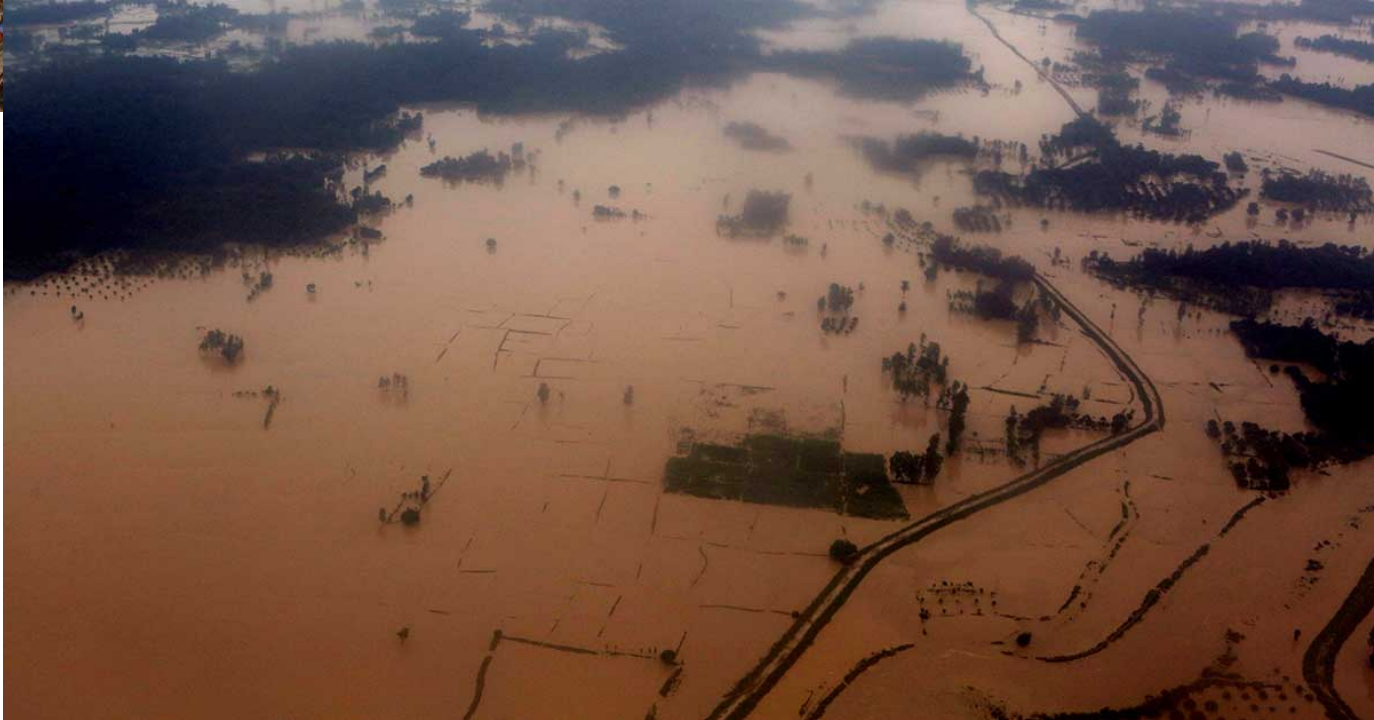
Nepal 2017 floods