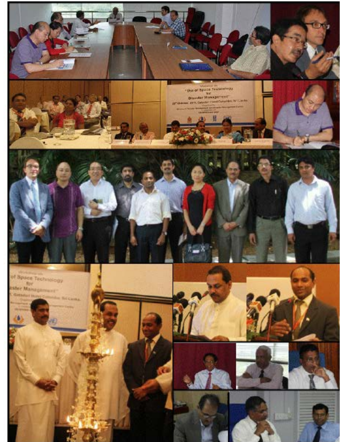
UN-SPIDER Technical Advisory Mission, Sri Lanka