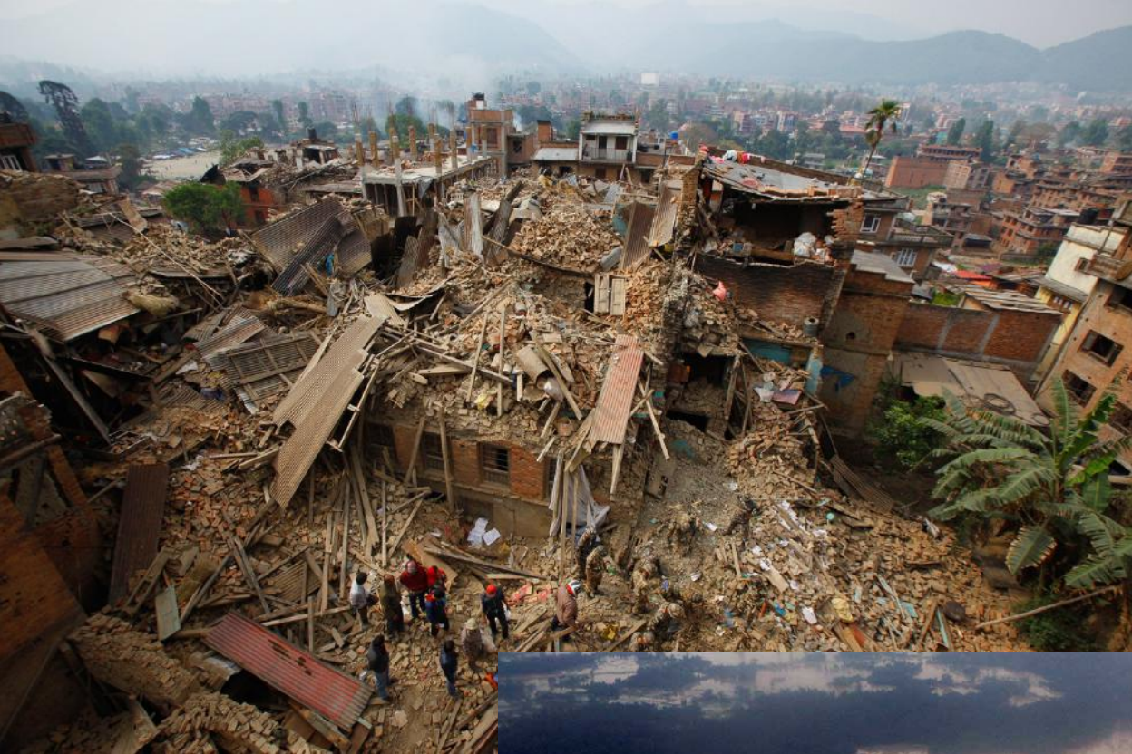
Nepal 2015 earthquake 9,000 deaths and 22,000 injured persons