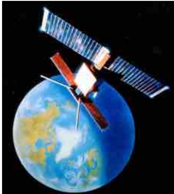
Support from space technologies