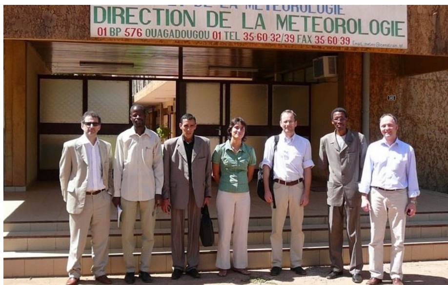
The Mission Team at the Burkina Faso Department of Meteorology

The mission team identified a number of activities which could lead to improved use of space-based information for disaster management in the country. Included in their list of recommendations were: to integrate space-based information elements into the National Multi-risk Contingency Plan currently under development; customized training sessions for remote sensing, GPS and geographic information systems; compilation of existing paper-based disaster information documents and integration of currently delinked information sources; and identification of a national focal point to request imagery from international satellite data mechanisms and to distribute it to the relevant end-users. UN-SPIDER will continue to work with Burkina Faso and the Mission Team in order to move forward with the insights gained. For the biennium 2008-2009, fifteen such UN-SPIDER Technical Advisory Missions are planned. Member States of the United Nations which are interested in receiving such advisory support should contact UN-SPIDER. ■