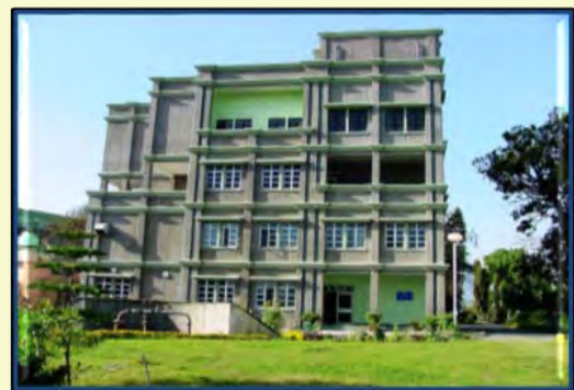
Indian Institute of Remote Sensing (IIRS)

The Centre for Space Science and Technology Education in Asia and the Pacific (CSSTEAP) was established in India in November 1995 with its headquarters in Dehradun and is the Centre of Excellence. The 1st campus of the centre was established in Dehradun, India at Indian Institute of Remote Sensing (IIRS) which is a unit of Indian Space Research Organization (ISRO), Government of India. For conducting its Remote Sensing (RS) & Geographic Information System (GIS) programs, the Centre has arrangements with IIRS as a host institution. The Centre has also arrangements with Space Applications Centre (SAC) Ahmedabad for hosting