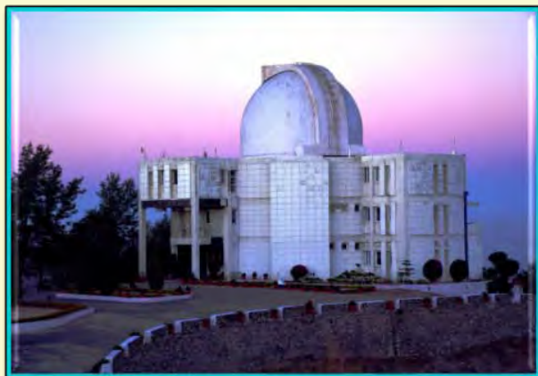
Mt Abu Infra-red Observatory

For astronomy and Solar Observations, two dedicated Observatories, one operating in Infra-red and other in visual bands are there at Mount Abu and Udaipur, respectively. An ambitious research plan for the next five years has been drawn up and space-based experiments in Astronomy, Atmospheric and Planetary Sciences are proposed. Computer facilities include a number of high power workstations with a large number of PCs connected through network with connectivity to Internet. PRL hosts an excellent library with a large collection of books and periodicals in varied fields of Space and Atmospheric Sciences.