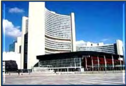
Office for Outer Space Affairs (UN-OOSA)

Space technology plays a very important role in improving the quality of life of today's human society for information and decision making. Most noticeable are communication, television, telemedicine, satellite navigation, remote sensing data, weather forecasting, disaster mitigation through emergency mapping, etc. All countries, irrespective of rich or poor, have realised the importance of space technology for improving the living conditions of their citizens. Therefore, all