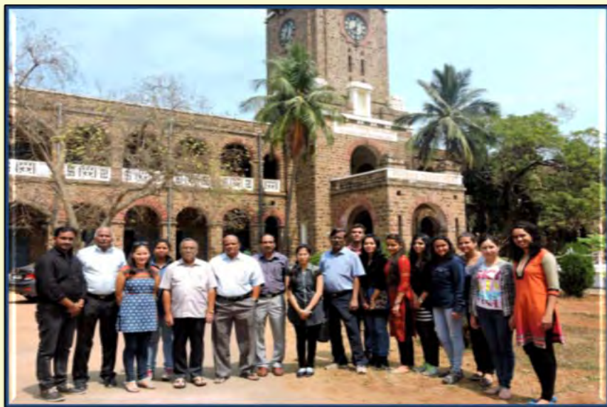
Andhra University (AU)

Andhra University was established in 1926. It is a premier institute of higher learning and it became a trendsetter in higher education and university administration. It is accredited with 'A' Grade by National Assessment and Accreditation Council of India and has ISO 9001:2008 certification for its quality standards. The University is strong in all faculties and was headed by great personalities like