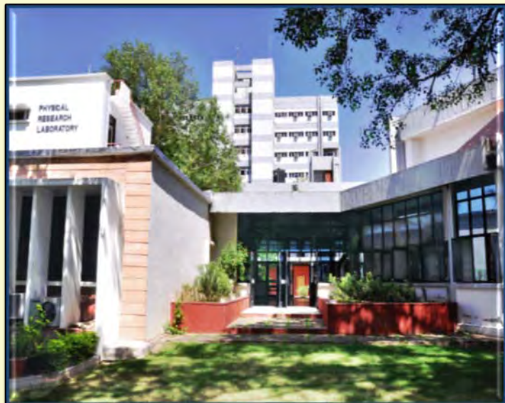
Physical Research Laboratory (PRL)

Physical Research Laboratory (PRL), founded in 1947 by Dr. Vikram Sarabhai, is a premier