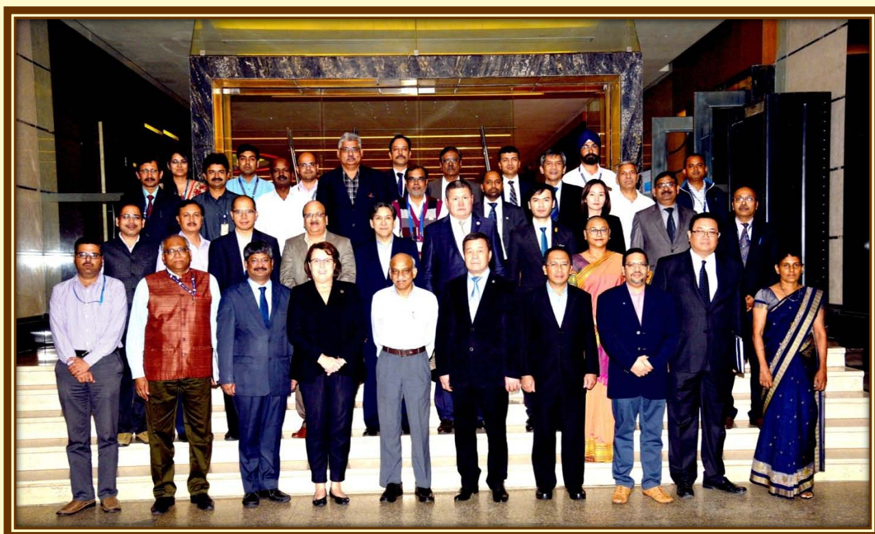
Governing Members and Special Invitees during the 22 nd G. B. Meeting on November 15, 2017 at Bengaluru