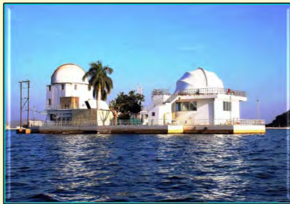
Udaipur Solar Observatory