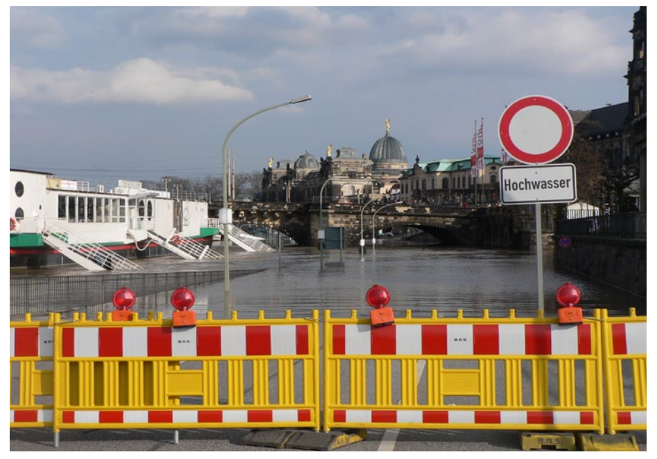
Flood in Dresden, Germany, in 2006

In recent decades, government agencies have implemented early warning systems as a way to reduce the impacts of natural hazards of different types. Implemented along with other disaster risk reduction measures, these systems help reduce the number of people killed or injured by natural hazards, as well as losses and damages.