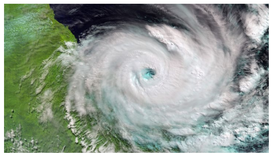
Cyclone Debbie captured by Copernicus Sentinel-3A satellite's Ocean and Land Colour Instrument as it struck eastern Australia on 27 March.

aimed at supporting the implementation of the Sendai Framework, for instance the UNISDR Science and Technology Conference on Disaster Risk Reduction held in Geneva. The Conference formulated a Science and Technology Roadmap, which outlines the expected outcomes and actions required from the science and technology community to contribute to the delivery of the four Priorities of Action of the Sendai Framework.